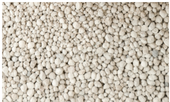
ARBOCEL® for anti-caking

Building on experience in virtually every industry sector, JRS Plant Fiber Agents have proven to be true solution providers in roller compaction, build-up agglomeration and problem solving for anti-caking or dust reduction!