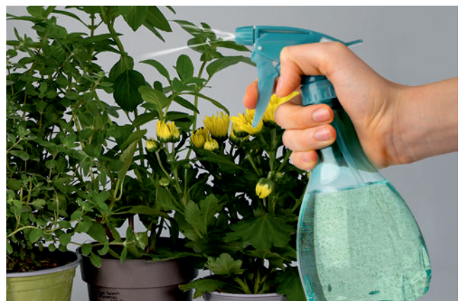
ARBOCEL® and VIVAPUR® MCG for thixotropy

Building on experience in virtually every industry sector, JRS Plant Fiber Agents have proven to be true solution providers in managing properties of all liquid substances. In fluid fertilizers and gels any kind of requirements in anti-settling, sprayability, anti-rinse-off, thixotropy and thickening can be managed by our organic agents.